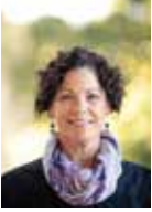
Colleen Nichols Judge (red'd) Placer County Superior Court